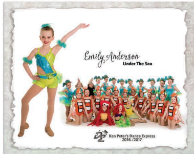
10x8 TeamMate (TM)

TOTAL FOR THIS ROUTINE $ _____ Paid by cc _____ cheque _____ cash _____ e-transfer _____