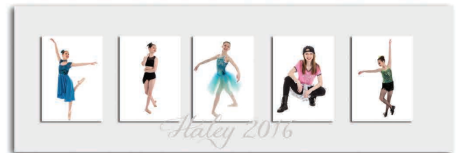
12 x 36 Template Collage

TOTAL FOR THIS ROUTINE $ _____ Paid by cc _____ cheque _____ cash _____ e-transfer _____