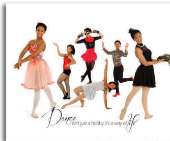
16x20 Custom Collages